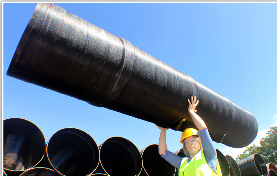
Engineer at RPC Broadmeadow demonstrating the lightweight nature of LWMVD.